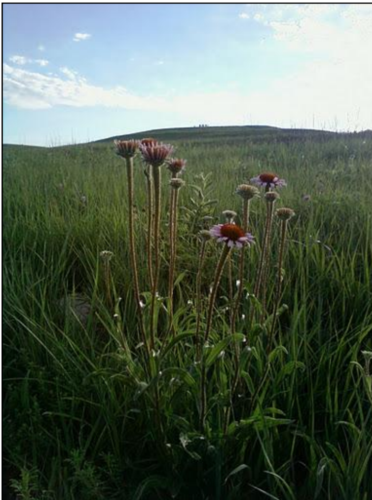
Purple Coneflower in the Flint Hills.

Though the current federal budget outlook looks to be the last time this federal grant program will be available, the awards to Kansas under the Sustainable Communities program bode very well for the state. The recent regional planning grant awards both to the Flint Hills Regional Council and the Regional Economic Area Partnership (Wichita) provide an opportunity to develop innovative models for rural planning that can be extended nationwide. These grants, together with the Challenge Grant awarded to the Mid-America Regional Council, are an acknowledgement of the strong collaborative planning work that has been fostered here in Kansas, and represent a unique opportunity for the future of planning in the Heartland.