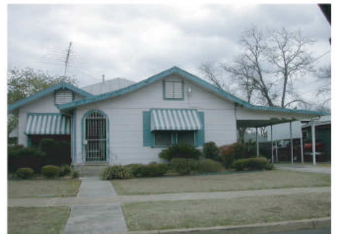
30 459 Drake Avenue Year Built: 1924 Total Lot Square Footage: 9,750 Living Area Square Footage: 1,702 Characteristics: Attached Open Porch, Asbestos Siding, Detached Carport, Shed, Terrace, Detached Garage