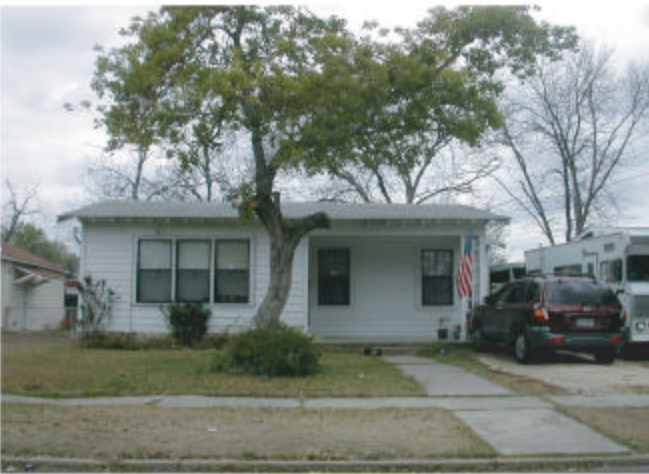
26 551 Drake Avenue Year Built: 1941 Total Lot Square Footage: 6,550 Living Area Square Footage: 840 Characteristics: Attached Open Porch, Wood Siding, Detached Garage, Detached Carport