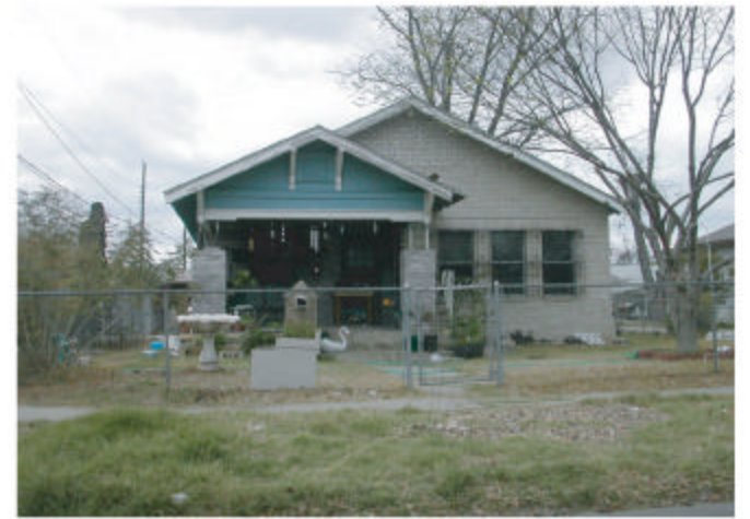
28 400 Cumberland Boulevard Year Built: 1923 Total Lot Square Footage: 6,550 Living Area Square Footage: 1,194 Characteristics: Attached Open Porch, Terrace Asbestos Siding