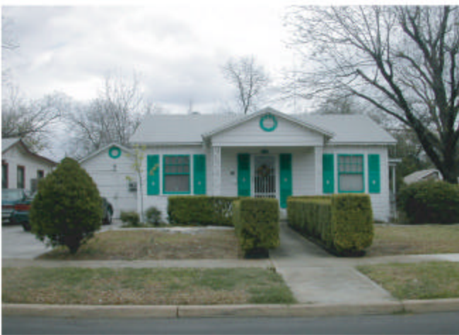
27 519 Drake Avenue Year Built: 1942 Total Lot Square Footage: 9,825 Living Area Square Footage: 1,270 Characteristics: Attached Open Porch, Wood Siding, Attached Garage, Attached Open Porch, Terrace