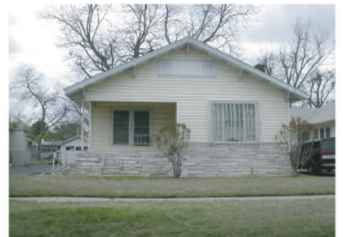
29 418 Cumberland Boulevard Year Built: 1925 Total Lot Square Footage: 6,500 Living Area Square Footage: 1,172 Characteristics: Attached Open Porch, Detached Garage