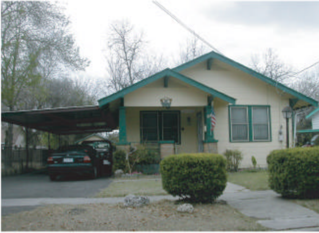
25 518 Cumberland Boulevard Year Built: 1930 Total Lot Square Footage: 6,550 Living Area Square Footage: 1,052 Characteristics: Attached Open Porch, Detached Garage, Asbestos Siding