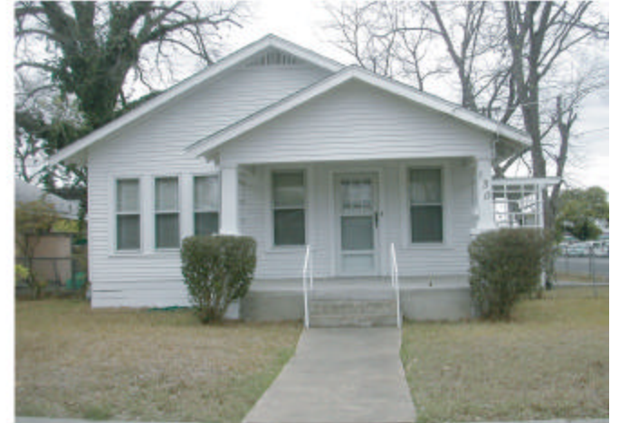
34 130 Drake Avenue Year Built: 1923 Total Lot Square Footage: 6,550 Living Area Square Footage: 1,202 Characteristics: Attached Open Porch, Wood Siding, Detached Garage