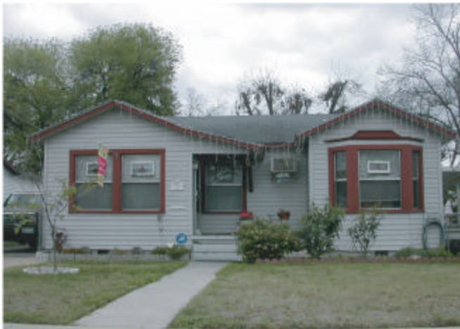
32 230 Drake Avenue Year Built: 1942 Total Lot Square Footage: 6,550 Living Area Square Footage: 848 Characteristics: Attached Open Porch, Wood Siding, Terrace