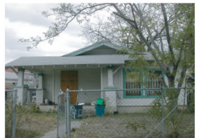
36 114 Drake Avenue Year Built: 1921 Total Lot Square Footage: 6,550 Living Area Square Footage: 1,555 Characteristics: Attached Open Porch, Wood Siding