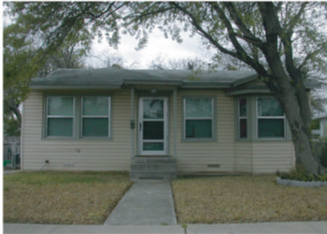
31 254 Drake Avenue Year Built: 1942 Total Lot Square Footage: 6,550 Living Area Square Footage: 1,419 Characteristics: Attached Open Porch, Detached Garage