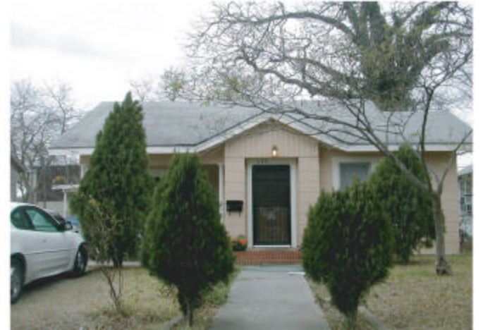
35 128 Drake Avenue Year Built: 1920 Total Lot Square Footage: 6,550 Living Area Square Footage: 1,317 Characteristics: Attached Open Porch, Asbestos Siding, Carport, Shed