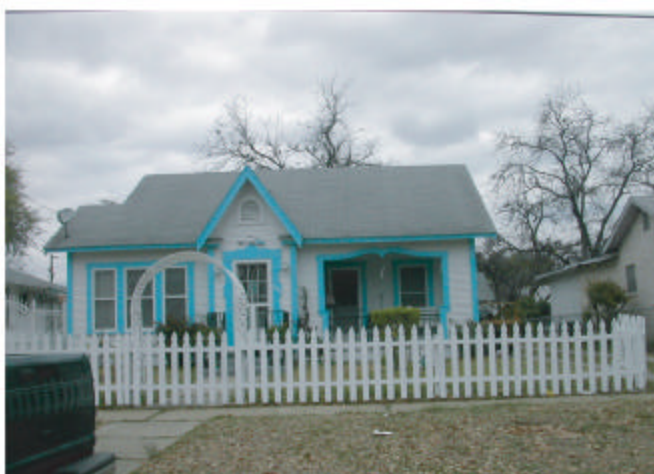
33 247 North Park Year Built: 1930 Total Lot Square Footage: 6,550 Living Area Square Footage: 1,296 Characteristics: Attached Open Porch, Wood Siding, Detached Garage, Detached Carport