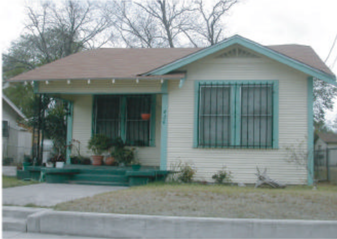
19 426 Floyd Avenue Year Built: 1930 Total Lot Square Footage: 6,250 Living Area Square Footage: 1,314 Characteristics: Attached Open Porch, Wood Siding