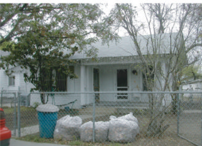
21 311 Finton Avenue Year Built: 1925 Total Lot Square Footage: 6,250 Living Area Square Footage: 514 Characteristics: Attached Open Porch, Wood Siding, Detached Garage, Shed