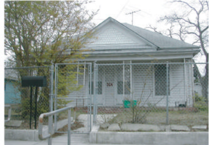
22 314 Floyd Avenue Year Built: 1909 Total Lot Square Footage: 12,500 Living Area Square Footage: 1,164 Characteristics: Attached Open Porch, Wood Siding, Detached Garage