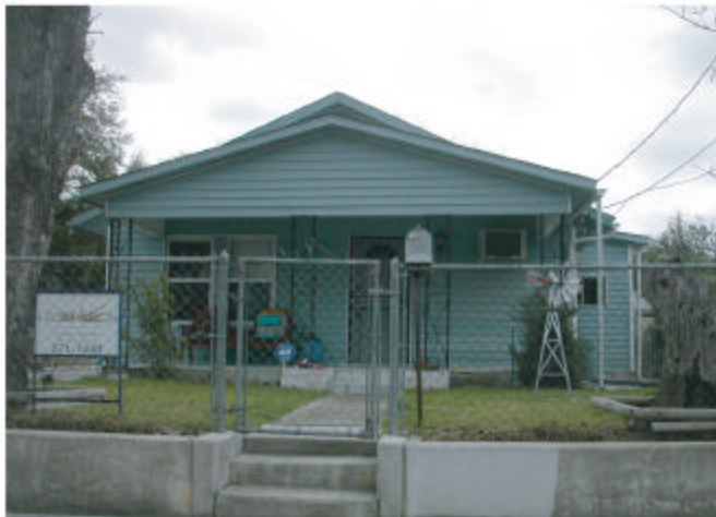
20 410 Floyd Avenue Year Built: 1940 Total Lot Square Footage: 6,250 Living Area Square Footage: 1,172 Characteristics: Attached Open Porch, Detached Carport, Detached Garage