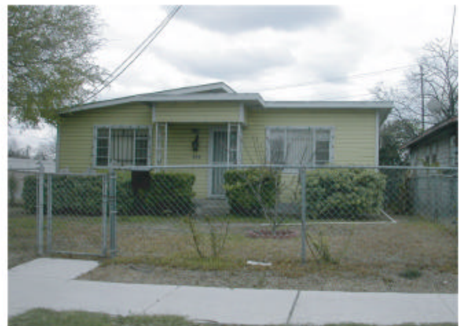
23 302 Floyd Avenue Year Built: 1958 Total Lot Square Footage: 6,250 Living Area Square Footage: 1,186 Characteristics: Attached Open Porch, Wood Siding, Terrace with Cover, Detached Carport