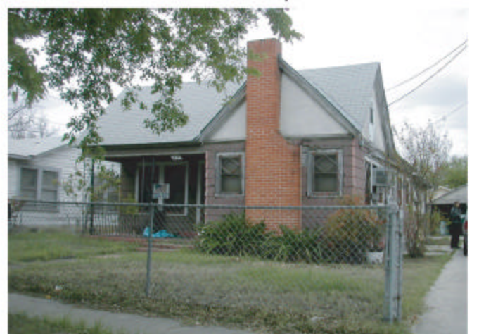
24 225 Finton Avenue Year Built: 1940 Total Lot Square Footage: 6,250 Living Area Square Footage: 856 Characteristics: Attached Open Porch, Asbestos Siding, Detached Garage, Shed, Attached Carport