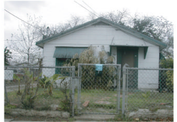
11 212 Pendleton Avenue Year Built: 1930 Total Lot Square Footage: 4,750 Living Area Square Footage: 740 Characteristics: Detached Garage, Asbestos Siding, Shed