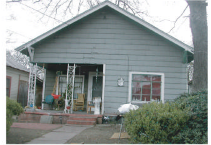
10 242 Pendleton Avenue Year Built: 1930 Total Lot Square Footage: 6,250 Living Area Square Footage: 798 Characteristics: Attached Open Porch, Wood Siding, Terrace with Cover