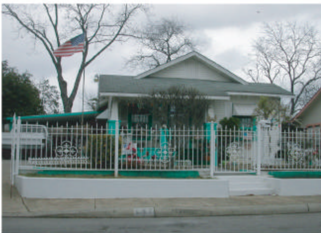
9 147 Southholme Year Built: 1940 Total Lot Square Footage: 6,250 Living Area Square Footage: 1,460 Characteristics: Attached Open Porch, Wood Siding, Detached Carport, Shed