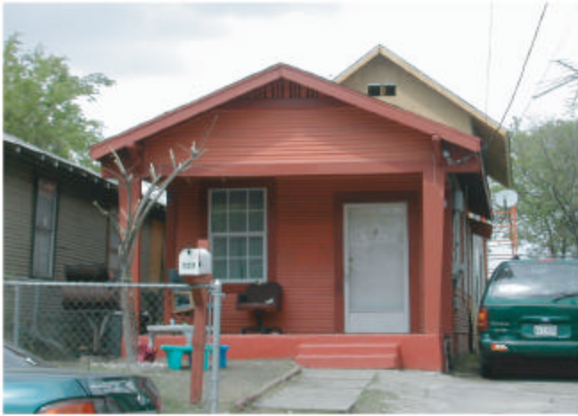
8 127 Southholme Year Built: 1930 Total Lot Square Footage: 3,125 Living Area Square Footage: 470 Characteristics: Attached Open Porch, Wood Siding