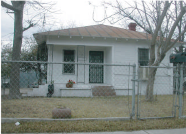
7 144 Pendleton Avenue Year Built: 1930 Total Lot Square Footage: 6,250 Living Area Square Footage: 648 Characteristics: Attached Open Porch, Shed, Wood Siding, Detached Garage