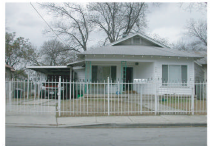
12 245 Southholme Year Built: 1940 Total Lot Square Footage: 5,625 Living Area Square Footage: 904 Characteristics: Attached Open Porch, Attached Carport, Attached Garage, Shed, Wood Siding