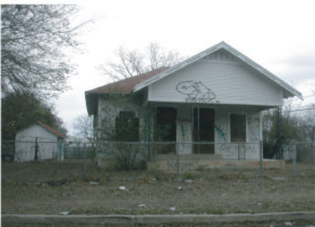
3 301 Pendleton Avenue Year Built: 1924 Total Lot Square Footage: 10,500 Living Area Square Footage: 1,064 Characteristics: Attached Open Porch, Wood Siding, Detached Garage