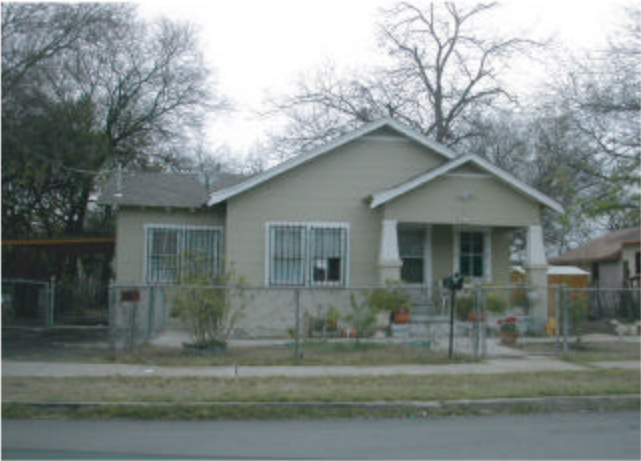
2 321 Pendleton Avenue Year Built: 1928 Total Lot Square Footage: 10,500 Living Area Square Footage: 834 Characteristics: Attached Open Porch, Carport, Asbestos Siding