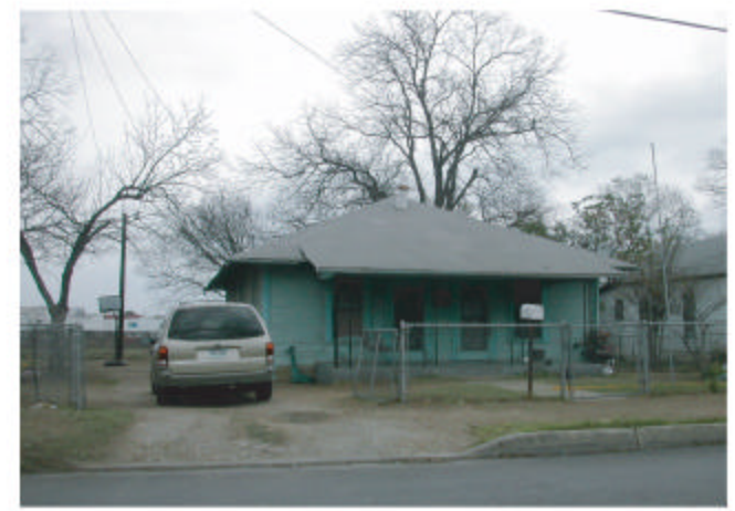
6 219 Pendleton Avenue Year Built: 1940 Total Lot Square Footage: 12,500 Living Area Square Footage: 1,456 Characteristics: Attached Open Porch Wood Siding, Detached Garage