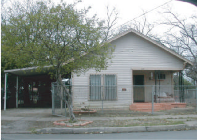
1 337 Pendleton Avenue Year Built: 1926 Total Lot Square Footage: 2,850 Living Area Square Footage: 1,044 Characteristics: Attached Open Porch ,Canopy Wood Siding