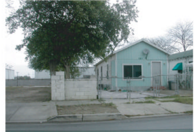
4 261 Pendleton Avenue Year Built: 1920 Total Lot Square Footage: 3,125 Living Area Square Footage: 504 Characteristics: Attached Open Porch Asbestos Siding