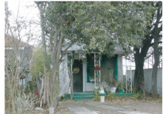
5 251 Pendleton Avenue Year Built: 1920 Total Lot Square Footage: 3,125 Living Area Square Footage: 648 Characteristics: Attached Open Porch Wood Siding