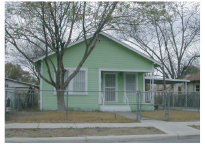
17 151 Wingate Avenue Year Built: 1945 Total Lot Square Footage: 10,500 Living Area Square Footage: 754 Characteristics: Attached Open Porch, Asbestos Siding, Detached Garage, Shed