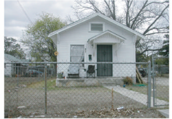
16 104 Nancy Place Avenue Year Built: 1946 Total Lot Square Footage: 7,000 Living Area Square Footage: 795 Characteristics: Attached Open Porch Wood Siding