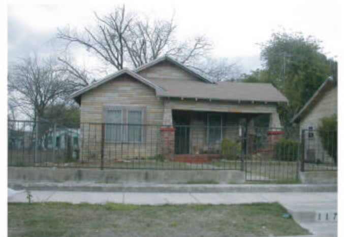
18 117 Wingate Avenue Year Built: 1924 Total Lot Square Footage: 14,000 Living Area Square Footage: 1,176 Characteristics: Attached Open Porch, Detached Garage, Shed