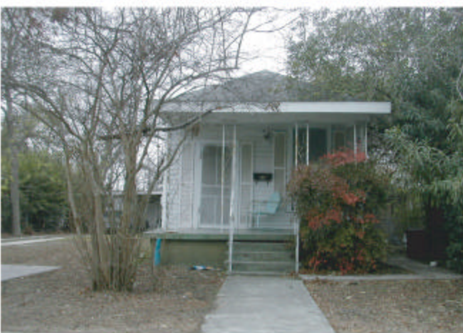
15 207 Wingate Avenue Year Built: 1915 Total Lot Square Footage: 7,000 Living Area Square Footage: 664 Characteristics: Attached Open Porch, Detached Garage, Wood Siding, Detached Patio, Detached Carport