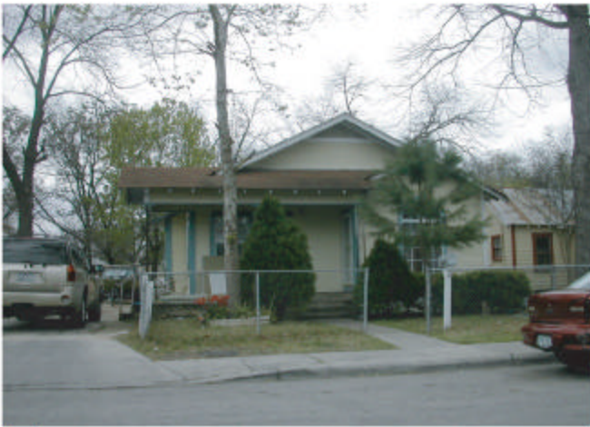
14 224 Nancy Place Avenue Year Built: 1930 Total Lot Square Footage: 7,000 Living Area Square Footage: 790 Characteristics: Attached Open Porch, Detached Garage, Wood Siding