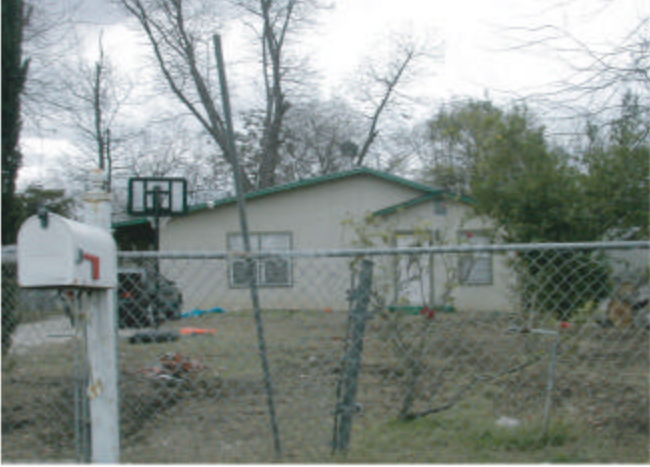
13 206 Wingate Avenue Year Built: 1925 Total Lot Square Footage: 7,000 Living Area Square Footage: 1,436 Characteristics: Attached Carport, Terrace