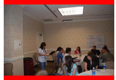
Recognizing LaP Leadership

The division is striving to address some of these ideas that are already integrated in this upcoming year's work plan.