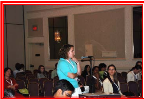
Participants actively engage in the various sessions.

About 50 participants attended this session addressing alternatives to criminalizing immigrant communities through blocking the use of public space, and shared experiences from their communities.